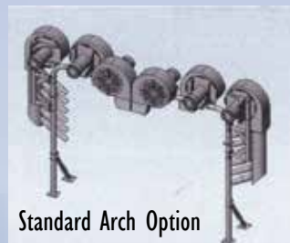
Standard Arch Option