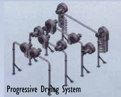
Progressive Drying System